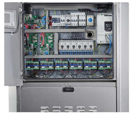
Convenient: Advanced pump management system with start/stop control