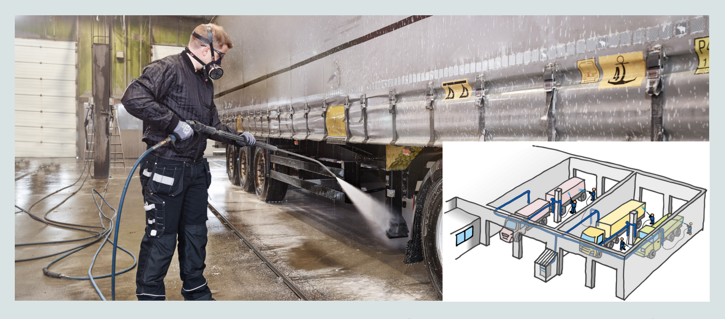
Large trucks wash area. Main applications being truck wash, pre-wash & cleaning of hard to reach areas as well as cleaning the inside of trailers. This company has 4 wash bays with up to 6 operators working simultaneously