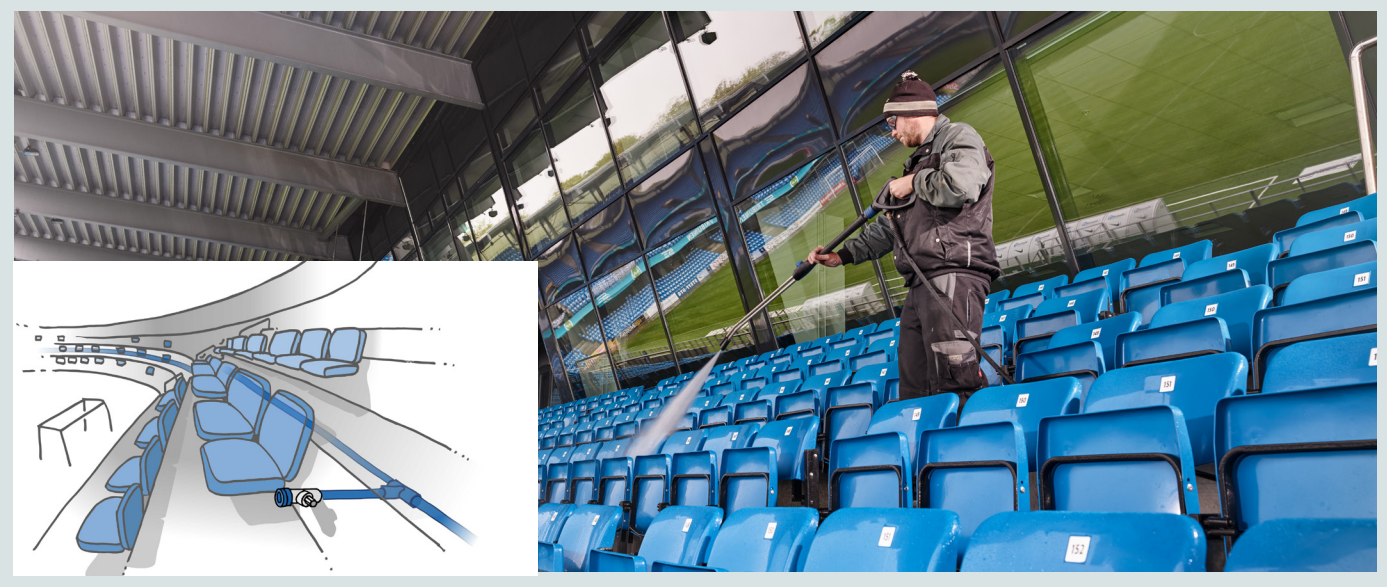
Cleaning of spectator area and seats in a stadium. Cleaning the spectator area after a game or an event can be difficult. In this example the stationary high pressure washer system (SC DELTA) enables multiple operators to clean fast and efficiently at the same time