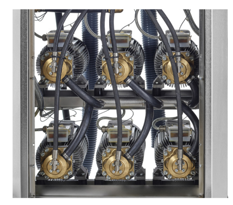
Easy service and maintenance: Time-saving access to motor pumps and other vital parts from top or front of the machine